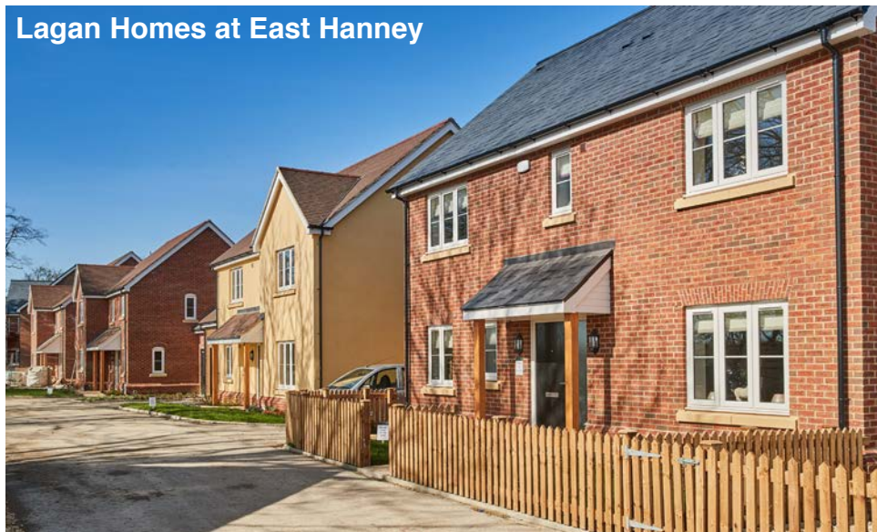
Lagan Homes at East Hanney