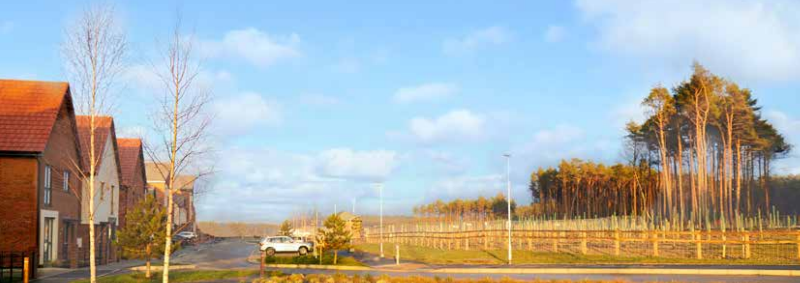
Previous Legal & General Homes Development, Buckler's Park, Crowthorne, Berkshire