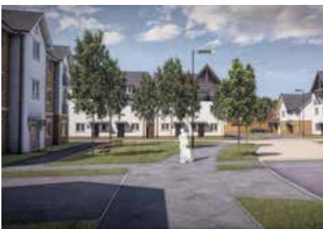
Images of house design

As we're building a community for the future too, we include provision for electric charging points as standard on homes with on plot parking, as well as minimising energy use by building well insulated and efficient homes. We use a range of house designs to create a varied and interesting series of streets. Some examples of this are below: